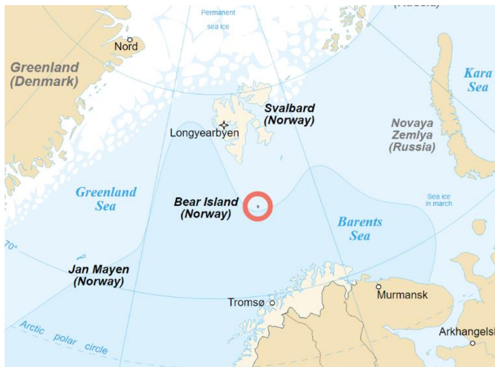
Figure 2. At September's FNC 419, the committee approved the addition of the Conventional name "Bear Island" for the remote island of Bjørnøya, Svalbard. Located between North Cape, Norway and Spitsbergen, Svalbard, the island is home to a nature preserve, meteorological station, and helicopter landing platform. (Map courtesy of Wikimedia Commons.)

To begin a feature search in the GNS database, please visit https://geonames.nga.mil/geonames/GNSHome/welcome.html .